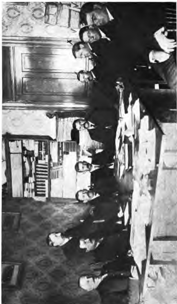
THE EXECUTIVE BOARD OF THE WESTERN FEDERATION OF MINERS, IN 1905.